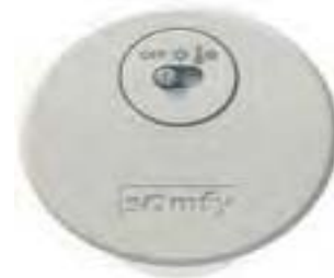
Indoor Wire Free™ RTS sun and temperature sensors