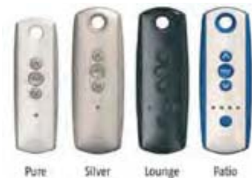
Somfy remote controls